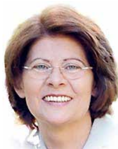
Renate Sommer Member of the European Parliament

Hosting the launch of the European Beer Pledge in February 2012 in the European Parliament I was impressed by the scope and ambition of the commitment being made not just by The Brewers of Europe, but by the national brewers associations of the European Union and the thousands of beer companies operating across the EU.