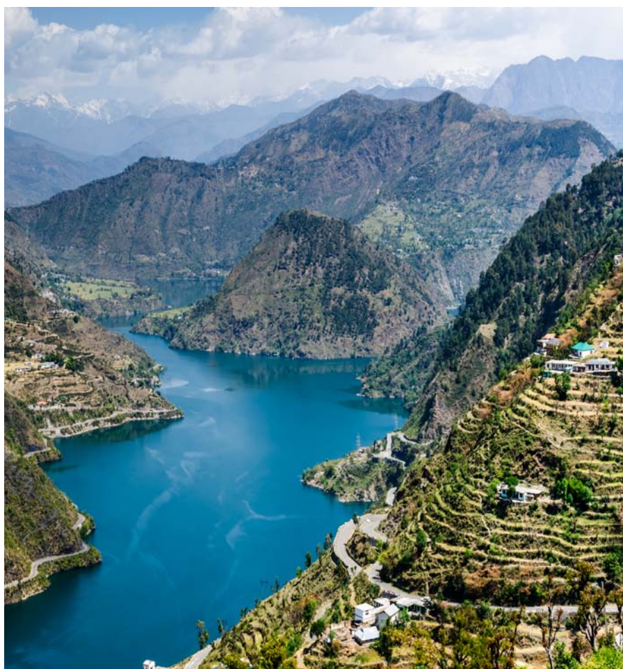
46kms long Tehri Lake filling up after the construction of the New Tehri hydro electric project dam on the River Ganga in Tehri Garhwal Chamba, India

The multiple benefits of regulatory and market instruments that promote resource-use efficiency include a resilience dividend. Achieving greater resource productivity can clearly have a direct developmental benefit, with better outcomes achieved for a given cost in terms of resources required. The resilience benefit is in addition to these cost savings, and it occurs through reducing the most acute trade-offs in resource use. Those trade-offs are sharpest where peak resource need coincides with peaks in resource scarcity – a typical example being the need for more freshwater for agriculture and domestic use just when the dry season is at its peak. Efficiency, combined with appropriate regulation, can reduce both overall resource use and the size of peaks in consumption, hence reducing the vulnerability of the system to market or climate shocks that would otherwise be unmanageable at times of the highest resource use. When it comes to energy resource use, greater efficiency brings benefits both for national development and a reduced global threat of climate change.