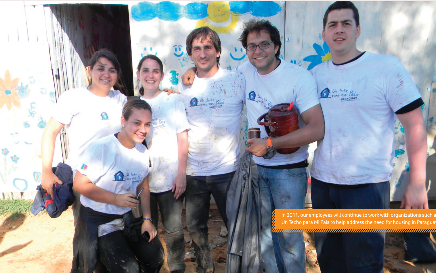
In 2011, our employees will continue to work with organizations such as Un Techo para Mi País to help address the need for housing in Paraguay.