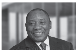
Cyril Ramaphosa Bproc LLD(hc)

Cyril Ramaphosa joined the board of SAB Ltd in 1997 and was appointed to the board of South African Breweries plc upon its listing on the London Stock Exchange in 1999. He is the founder and chairman of Shanduka Group and Joint Non-Executive Chairman of Mondi Group. He holds directorships in Macsteel Global B.V., MTN Group Ltd, The Bidvest Group, Lonmin plc, Standard Bank, Optimum Coal Holdings Limited and Alexander Forbes.