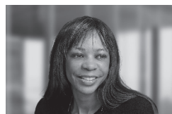
Dambisa Moyo BSc, MPA, MBA, Ph.D