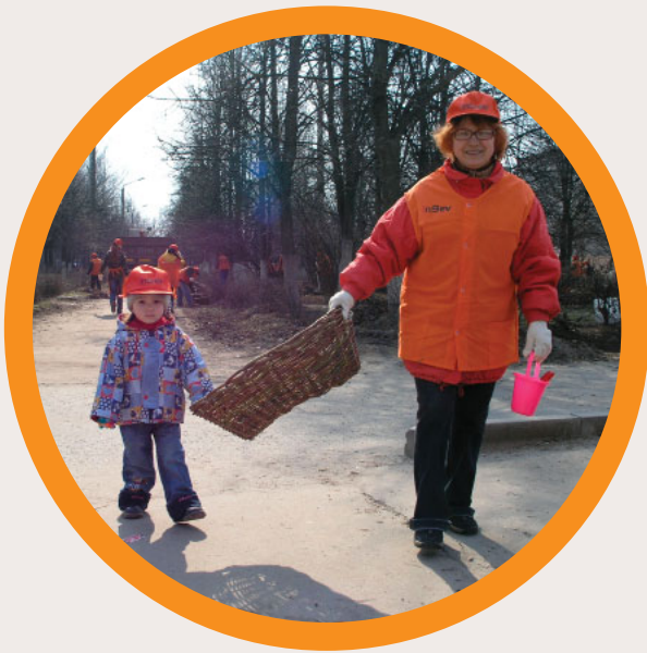
In all SUN InBev brewery cities, our employees join citizens in traditional street cleanings every spring.

The program is implemented in several stages: